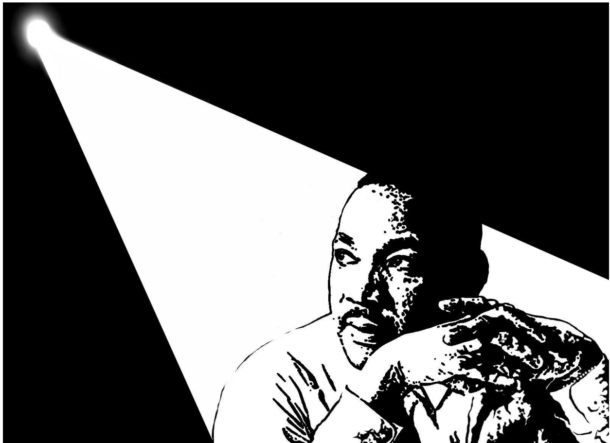
T-shirt image designed by Sandy Phillips

Using carpenter hall as our overflow space has pluses and minuses. It's nice to have a space we control and know that the connection will be consistent. The show on stage needs better lighting if we want the video to really work. Audience reacted as if the secondary space was very far away. It's too bad the Innerchild Café/Culture Works space is out of business. A few blocks does make a difference. The space was used very well by the choir members and that was a plus.